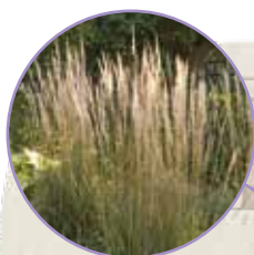
Feather Reed Grass Calamagrostis acutiflora 'Karl Foerster'

Use Pop Star® as a low hedge along a pathway to visually draw the eye in.