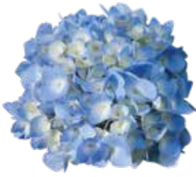
THE ORIGINAL Bigleaf Hydrangea

The Original was the first reblooming bigleaf hydrangea introduced in the collection. The Nantucket blue or soft pink flowers are a garden classic, and for good reason!