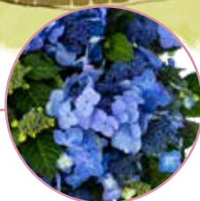
Pop Star® Bingleaf Hydrangea Hydrangea macrophylla 'Bailmaccs' PP33,703