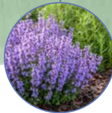
Cat's Pajamas Nepeta Nepeta x 'Cat's Pajamas' PP31,127