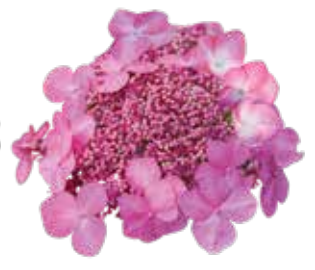
TWIST-N-SHOUT® Bigleaf Hydrangea

Providing an elegant touch to the garden, the large white blooms age with tones of blush pink. That's no surprise with a name like Blushing Bride.