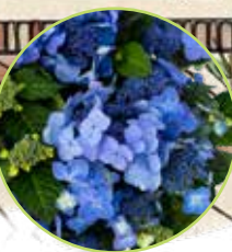
Pop Star® Bigleaf Hydrangea Hydrangea macrophylla 'Bailmaccix' PP33,703