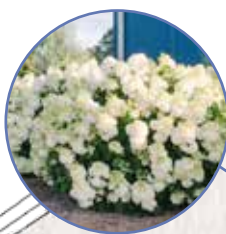
First Editions® Little Hottie® Panicle Hydrangea Hydrangea paniculata 'Bailpanone' PP32,549

The electric blue blooms add vibrancy and balance to this color palette.