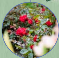
Easy Elegance® Paint the Town Rose Rosa 'BAItown' PP18,060