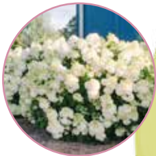
First Editions® Little Hottie® Panicle Hydrangea Hydrangea paniculata 'Bailpanone' PP32,549