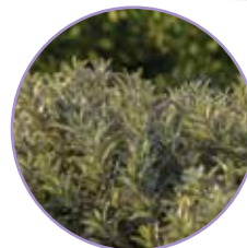
First Editions® Iceberg Alley® Sageleaf Willow Salix candida 'Jefberg'