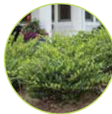
First Editions® Vintage Jade Distylium Distylium 'Vintage Jade' PP23,128