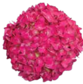
SUMMER CRUSH® Bigleaf Hydrangea

Add up the vivid rose-pink or blue-purple flowers, striking red stems, and deep green leaves and you've got an unforgettable hydrangea that makes an impact.