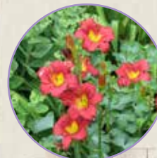
Ruby Stella Daylily Hemerocallis 'Ruby Stella'