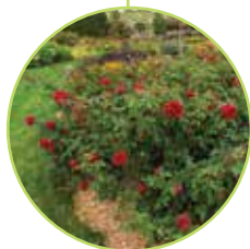
Easy Elegance® Kashmir Rose Rosa 'BAImir'