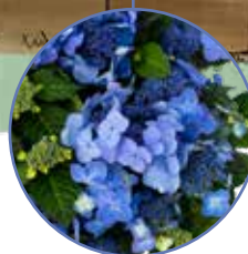
Pop Star® Bigleaf Hydrangea Hydrangea macrophylla 'Bailmacs' PP33,703