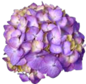
BLOOMSTRUCK® Bigleaf Hydrangea

The Original was the first reblooming bigleaf hydrangea introduced in the collection. The Nantucket blue or soft pink flowers are a garden classic, and for good reason!