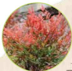
First Editions® Cool Glow® Pomegranate Nandina Nandina domestica 'ZhNan53' PP32,422