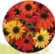
Cheyenne Spirit Coneflower Echinacea hybrida 'Cheyenne Spirit'

Mix perennial color and an evergreen shrub with this warm-climate celebration of hydrangeas!