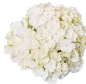
BLUSHING BRIDE Bigleaf Hydrangea

Compact and covered in massive raspberry red or neon purple blooms, Summer Crush® is a must for decorative containers.