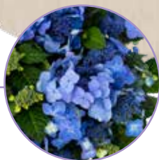
Pop Star® Bigleaf Hydrangea Hydrangea macrophylla 'Bailmacsix' PP33,703