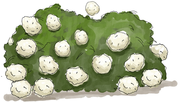
OTHER SMOOTH HYDRANGEAS

Unlike comparable smooth hydrangeas on the market, FlowerFull® Smooth Hydrangea stands out with its strong stems that resist flopping and offers nearly three times the blooms. Its superior structure and lush flowering set it apart, delivering a more robust and long-lasting display.